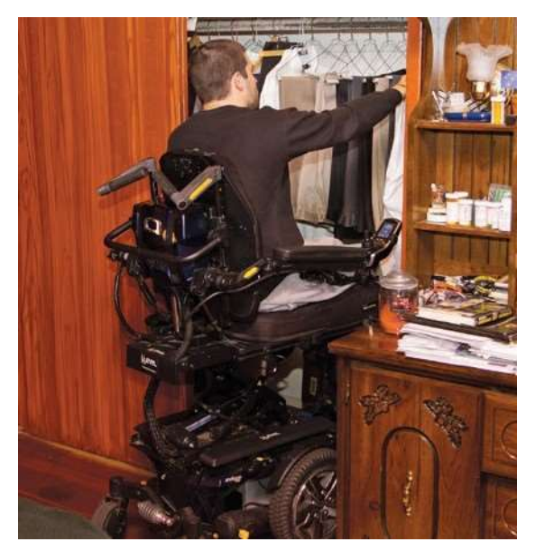
To perform all aspects of the dressing MRADL, Kiel must be able to access the clothes hangers at 65" as well as the closet shelves at 68".